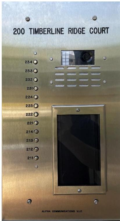
Front Door Panel

Each building will have a new front door panel and each condo will be fitted with the indoor access panel shown below.